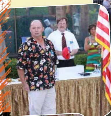
LeTip members and guests gathered around the pool at The Holiday Inn.